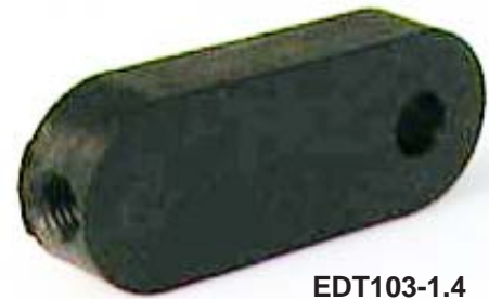
EDT103-1.4 or EDT103-5/16